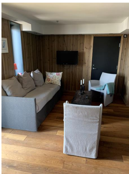
Living room with sleepers sofa