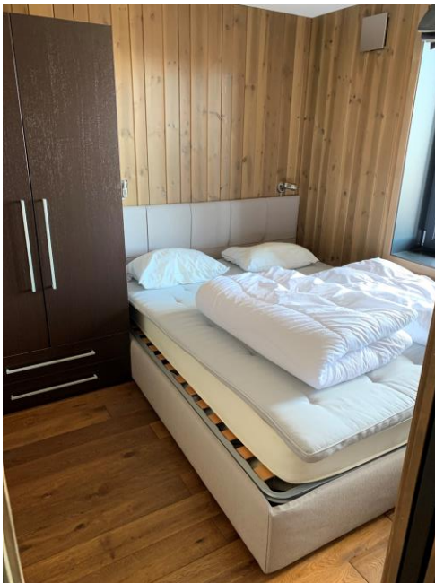
Bedroom with king size bed